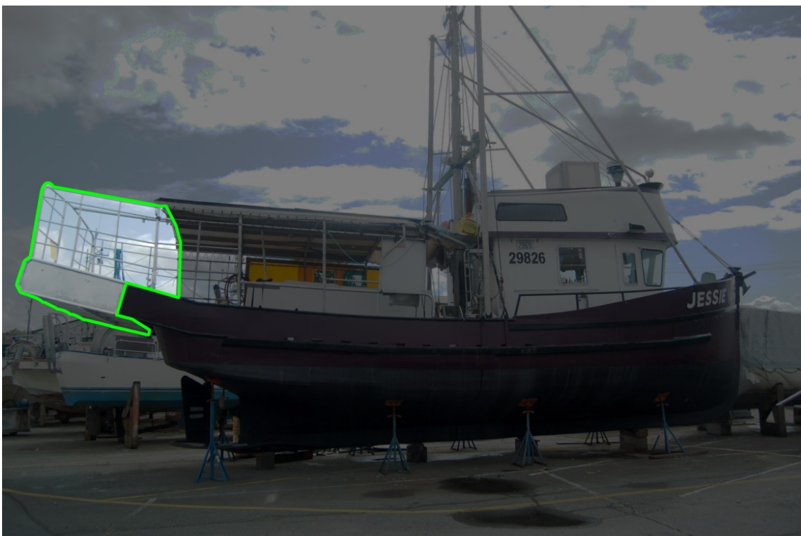
Figure 1 – Commercial Fishing Vessel with Stern Extension Highlighted