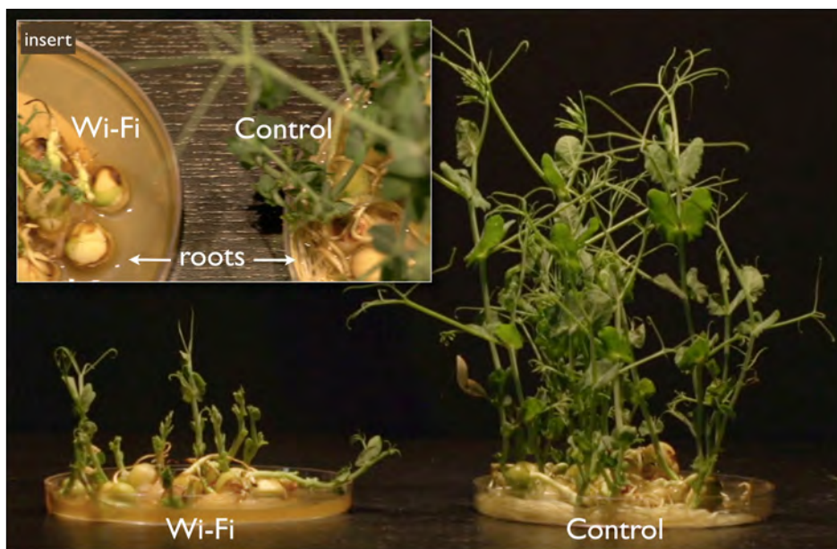
Plate 1. Growth of pea seedlings exposed to Wi-Fi radiation for one month compared with controls that were not exposed to radiation. Wi-Fi radiation reduced root growth (insert) and reduced above ground biomass. [Source: Havas and Symington (2016) ]

growing area is exposed to this type of electromagnetic pollution. Cell phone base stations also generate microwave frequencies and the ones in the country are spaced further apart and are more powerful than those in urban centres.