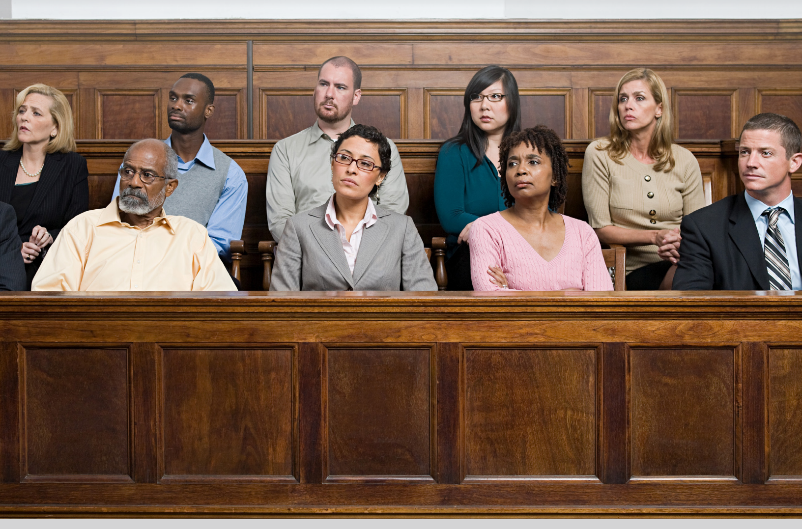
MAY 2018 42<sup>nd</sup> PARLIAMENT, 1<sup>st</sup> SESSION