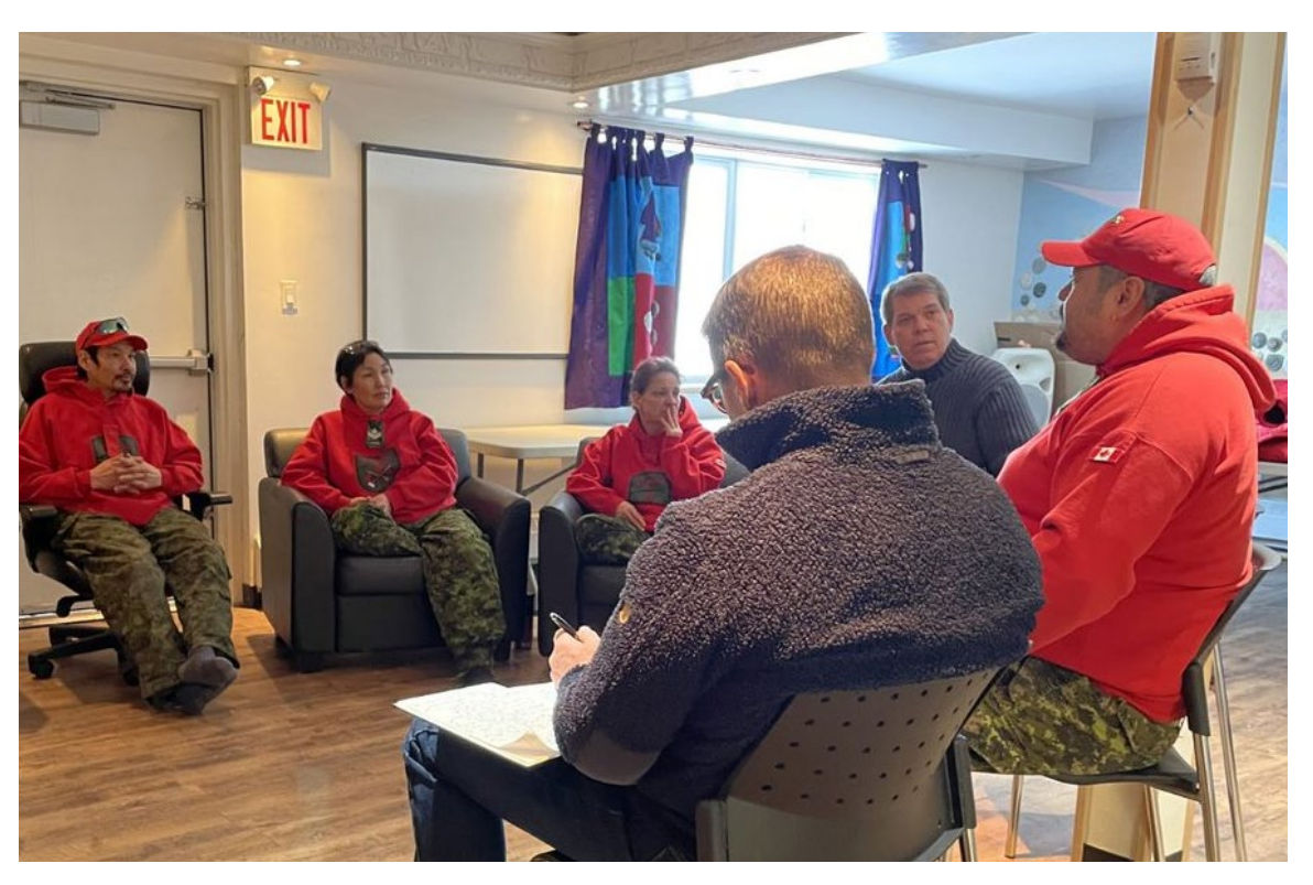
Figure 4—Members of the committee meet with Canadian Rangers in Kugluktuk, Nunavut