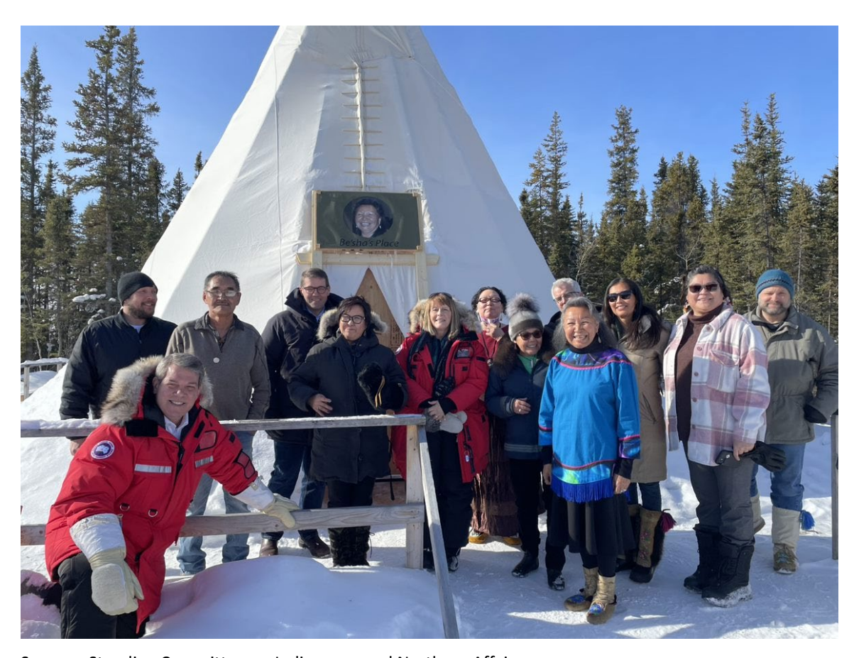
Figure 1—Members of the Standing Committee on Indigenous and Northern Affairs visited the Arctic Indigenous Wellness Foundation in Yellowknife, Northwest Territories