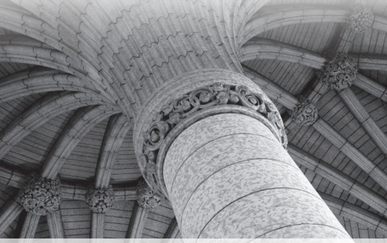
APRIL 2018 42<sup>nd</sup> PARLIAMENT, 1<sup>st</sup> SESSION